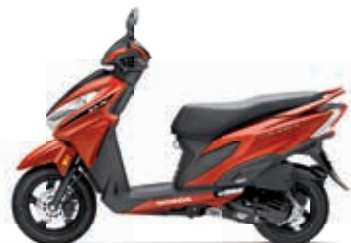
Neo Orange Metallic