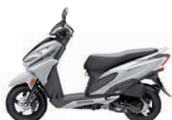
Pearl Amazing White