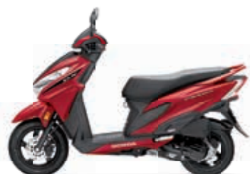
Pearl Spartan Red