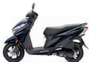
NEW Pearl Siren Blue