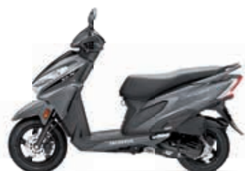
Matte Axis Grey Metallic