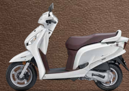
Pearl Amazing White