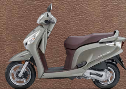
Matte Selene Silver Metallic