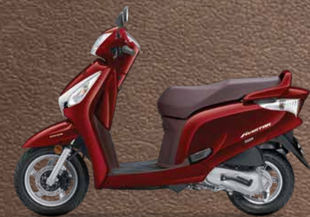
Pearl Spartan Red