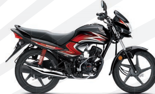
BLACK WITH RED STRIPES