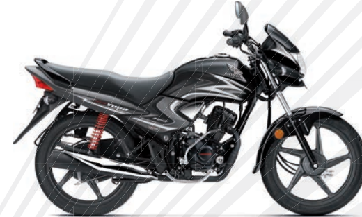
BLACK WITH HEAVY GREY METALLIC