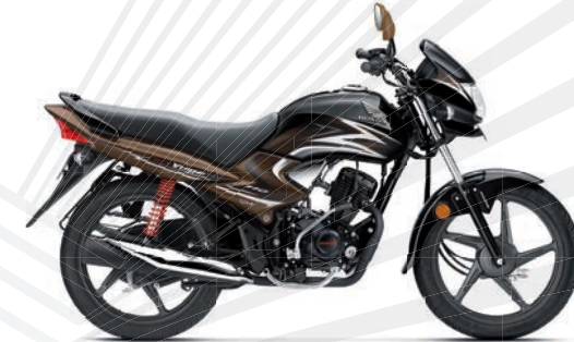
BLACK WITH SUNSET BROWN METALLIC