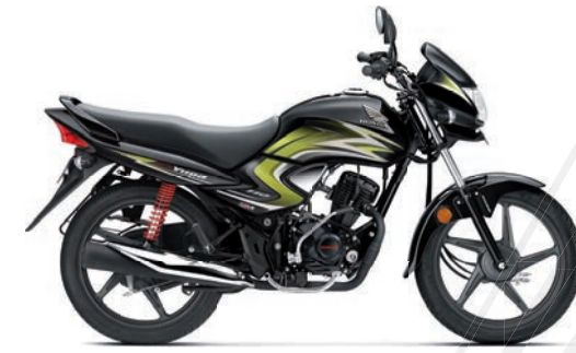
BLACK WITH LEMON ICE YELLOW GRAPHICS