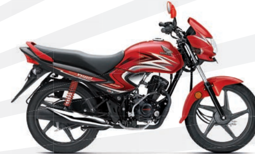
SPORTS RED WITH BLACK