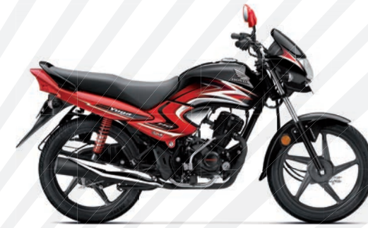
BLACK WITH RADIANT RED METALLIC